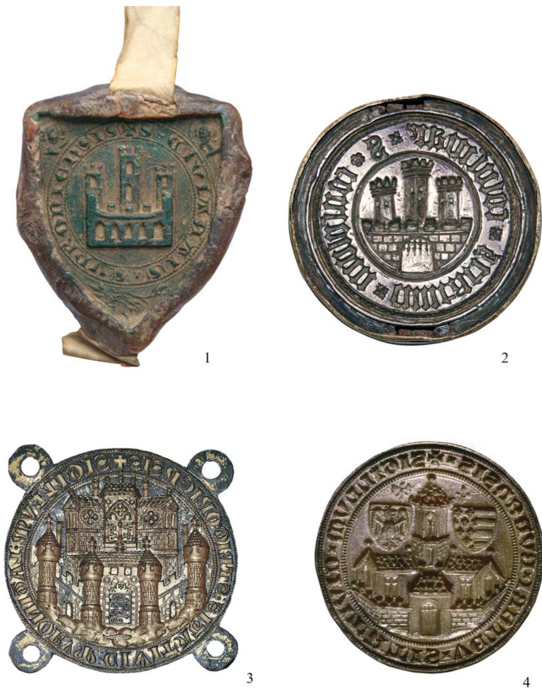
Fig. 2. Municipal seals and seal matrices with architectonic elements, 1. Imprint of the municipal seal of Sopron, endorsed by King Charles I in 1340 appended to a document issued on March 15, 1389, HU MNL Sopron Archives of Győr-Moson-Sopron county, DL 276.; 2. Seal matrix of the town of Cluj (Kolozsvár/Klausenburg), 1480. National Archives of Romania, Cluj-Napoca Branch; 3. Reverse side of the seal matrix of the double seal of the Esztergom Latini, 1240s-1250s, based on an earlier model. Hungarian National Museum; 4. Seal matrix of the reginal town of Óbuda, 1370s. Hungarian National Museum