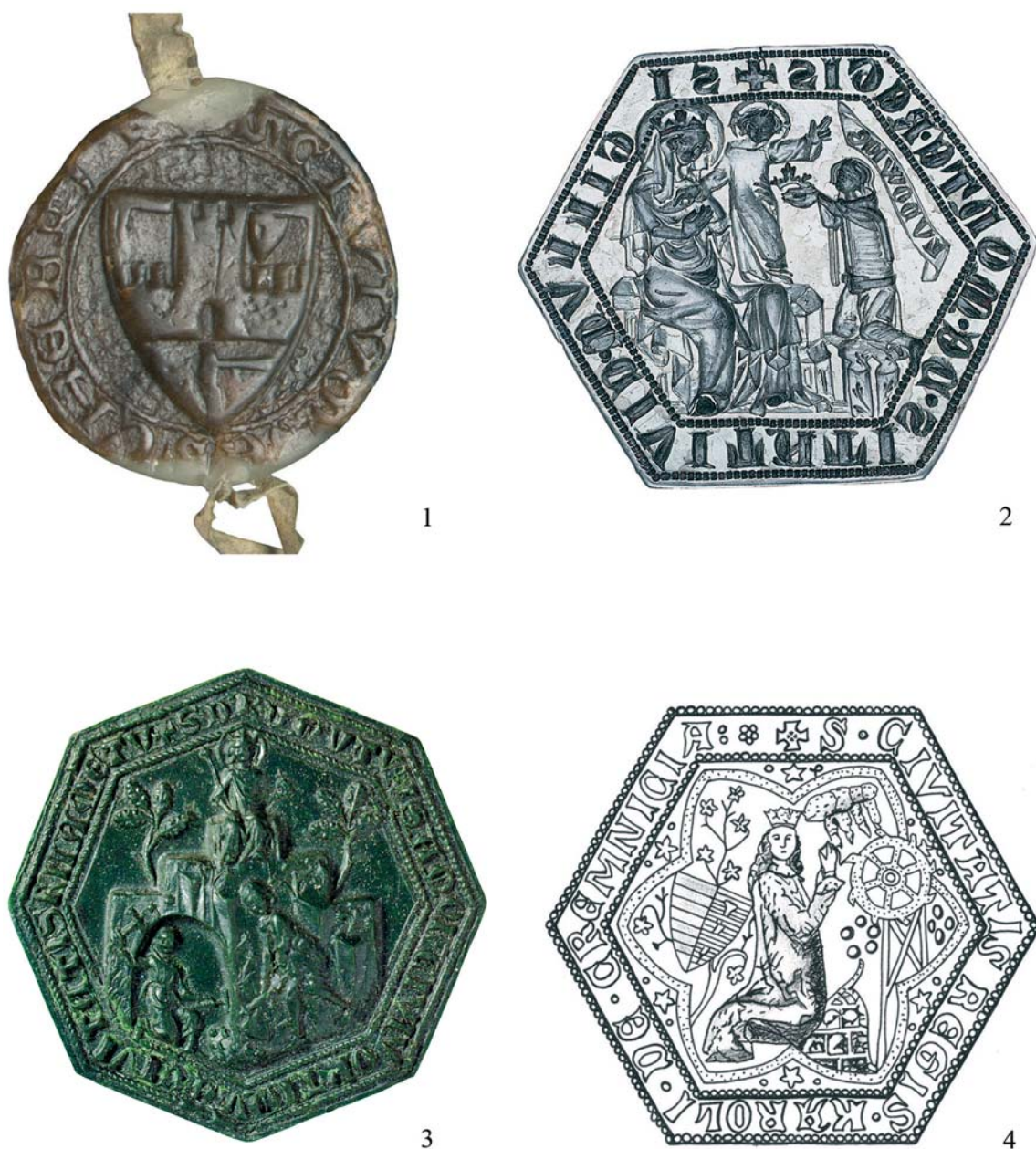
Fig. 3. Municipal seals and seal matrices of mining towns, 1. The municipal seal of Banská Štiavnica, 1275. National Archives of Hungary, HU MNL OL DL 923; 2. Matrix of the municipal seal of Nová Baňa, before 1348. Hungarian National Museum; 3. Copy of the municipal seal matrix of Baia Mare, c. 1350. National Archives of Hungary, HU MNL OL, V 8–1170; 4. The municipal seal of Kremnica, 1331 (©Drawing by Anna Grüll)

The seal of Kremnica, which bears the oft-debated image of Charles I or perhaps St. Catherine next to an ore-mill and a smelting furnace ( fig. 3.4 ), may be conjecturally matched with some information on a well-known goldsmith of the period, Peter son of Simon from Siena, who worked on the matrix of Charles I's majesty seal and probably also on the design of Charles's first golden florin. For these services to the court, he was lavishly remunerated by a royal grant to the estate of Jamník (Jemnyk, Slovakia) in Szepes county. The spatial and chronological proximity of the donation (the Spiš/Szepesség/Zips region, where Jamník lies is in the vicinity of the Upper Hungarian mining towns) allows us to assume that besides the king's majesty seal, the Italian