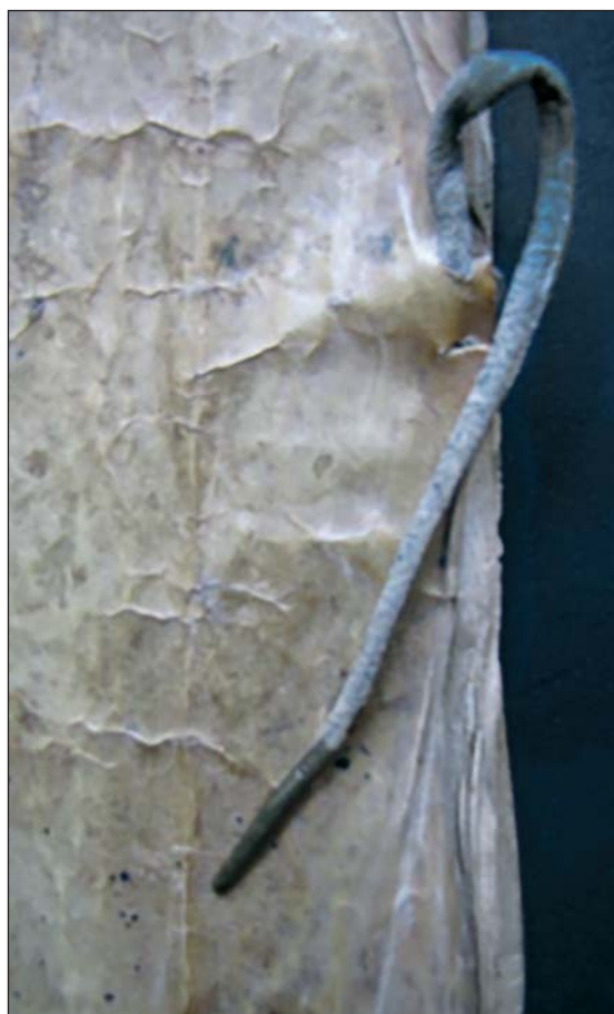
Fig. 5. “Italian-style” parchment binding of the 1427. municipal accounts of Sopron, with metal tag on the lace. HU MNL Sopron Archives of Győr-Moson-Sopron county, DL 3284

document that was no longer relevant, or a parchment codex leaf. The latter raises important questions of provenance and access, and there is a growing corpus of evidence indicating that trade in easily transportable dissected codex folios is responsible for at least part of the archival binding materials. 59 In other cases, it is possible to connect the availability of sheets to local events or cataclysms, for instance in Sopron with the expulsion of the local Jewish community in 1526, and later with the Reformation. 60 In case of the reuse of Hebrew codex leaves, intentional humiliation may have accompanied the pragmatic considerations. 61