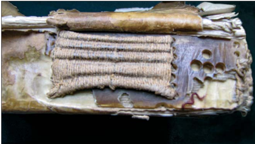
Fig. 6. Spine and binding of the first municipal book of Sopron begun in 1390. HU MNL Sopron Archives of Győr-Moson-Sopron county, DL 2988