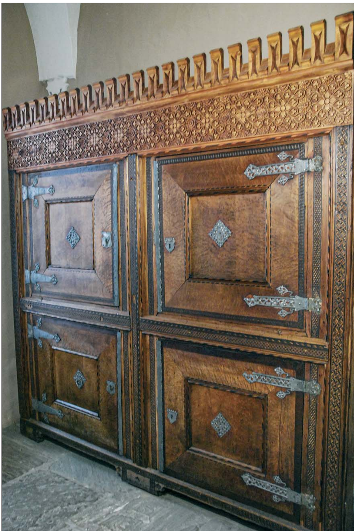
Fig. 7. Archives cabinet in the town hall of Bardejov (Bártfa/Bartfeld)